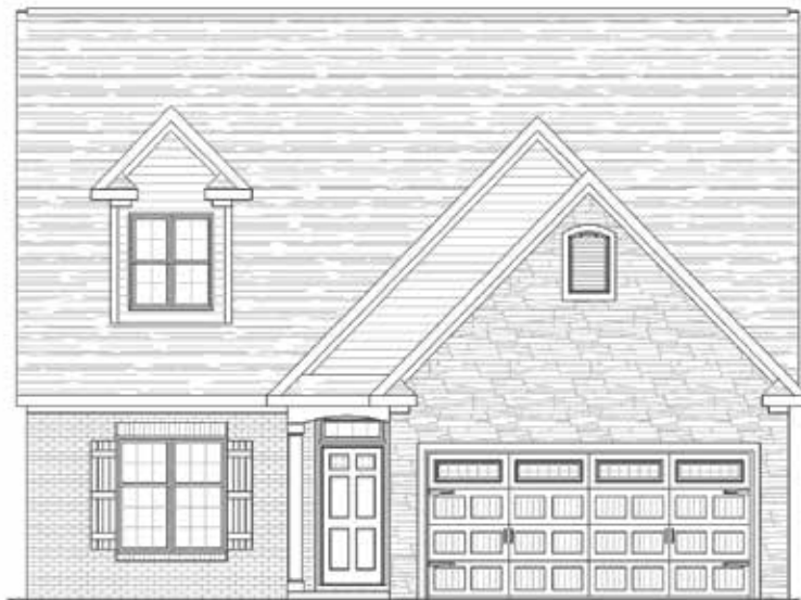
ELEV. A SHOWN W/ OPT. BRICK & STONE

1,322 s.f. - 1st Floor 938 s.f. - 2nd Floor 2,260 s.f. - Total