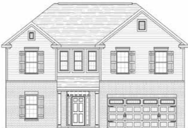
OPT. TRANSOM ELEV. A SHOWN W/ OPT. BRICK, OPT. HIP ROOF & OPT. 9' CLG.