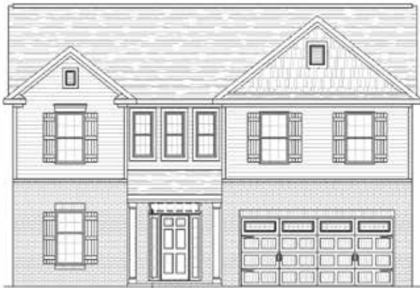
OPT. TRANSOM ELEV. A SHOWN W/ OPT. BRICK, OPT. 9' CLG & OPT. SHAKES