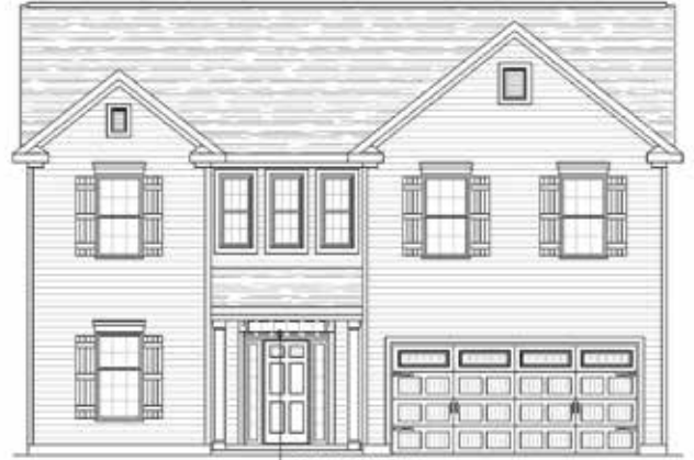
OPT. TRANSOM ELEV. A SHOWN W/ OPT. 9' CLG.