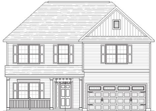
OPT. TRANSOM ELEV. A SHOWN W/ OPT. 9' CLG, OPT. HIP ROOF, OPT. FULL PORCH, OPT. RAILING, OPT. SIDELT, OPT. BOARD & BATTEN & OPT. CROSSHEADS