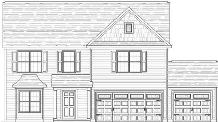
ELEV. A SHOWN W/ OPT. 3 CAR GARAGE, OPT. BAY & OPT SHAKES