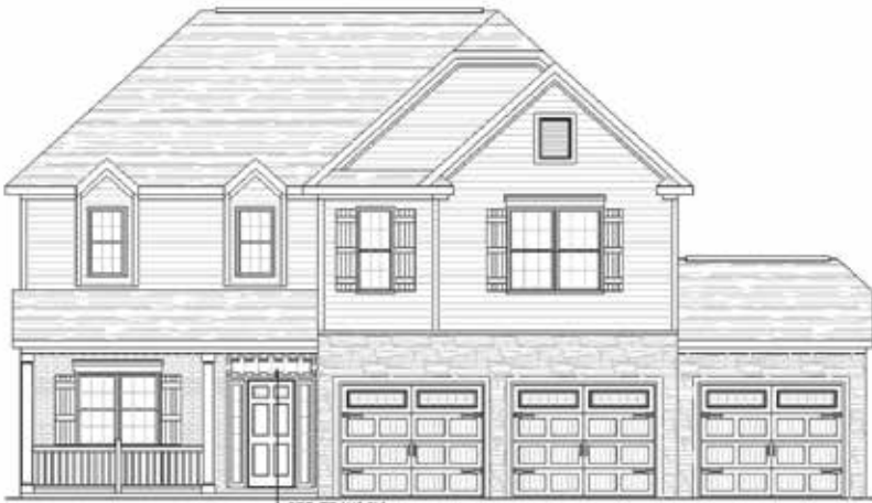
ELEV. A SHOWN W/ OPT. 9' CLG. OPT. HIP ROOF, OPT. BRICK & STONE, OPT. 3RD CAR GARAGE & OPT. RAILING