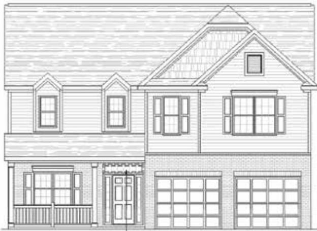
ELEV. A SHOWN W/ OPT. 9' CLG, OPT. BRICK, OPT. SHAKES & OPT. RAILING